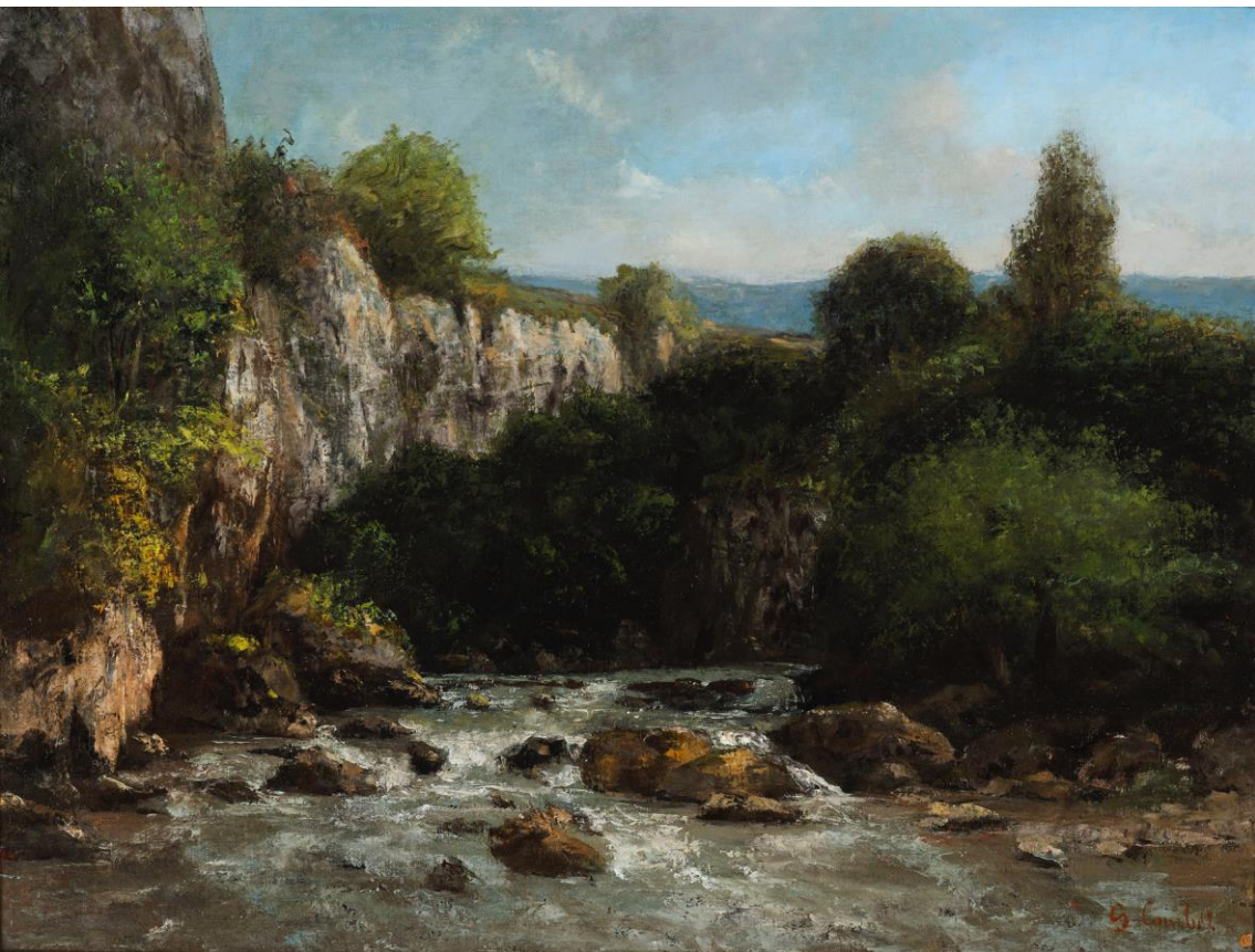
Gustave Courbet, Les Gorges de la Loue, ca. 1860-63, oil on canvas, 74.5 x 101 cm